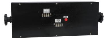
360° Rotate clamp