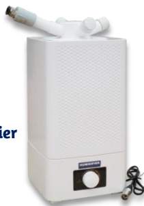
External Humidifier System