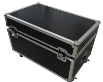
Carrying case (optional)